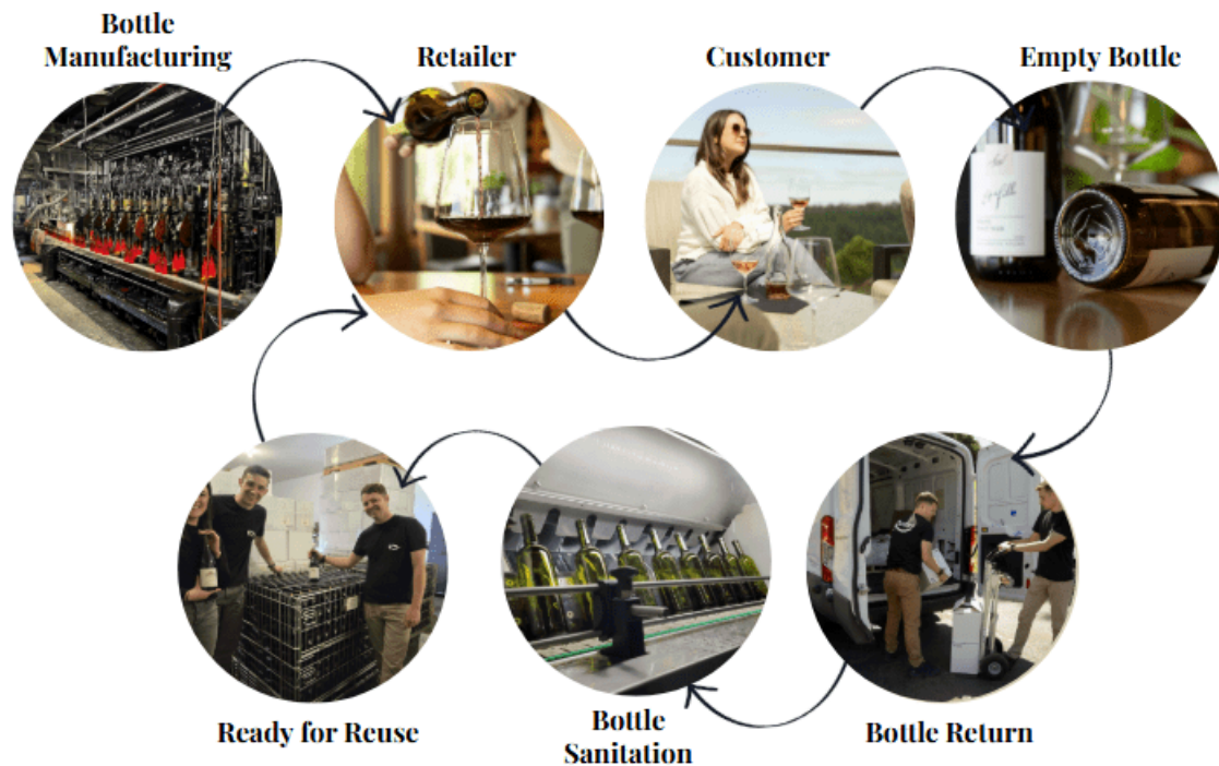
Figure 4 Circular economy at Revino visual. Adapted from https://www.revinocontainers.com/returns/

address this infrastructure gap within Oregon’s regional beverage market by offering standardized bottles, reverse logistics, and centralized washing services to small and mid-sized producers.